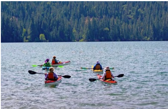
Kayakers enjoy the serenity of morning on Scotts Flat Reservoir during 2018's No Motor Day. Read more here .