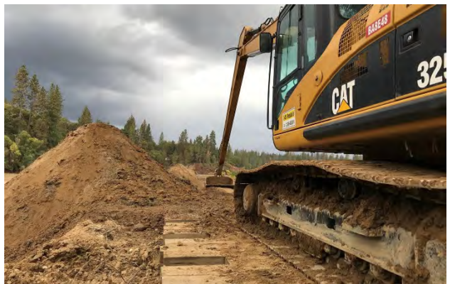
About 40,000 cubic yards of sediment were removed from the Combie Reservoir last fall.

Findings from this project will help state regulators and water managers address mercury in the aquatic food chain at locations around the Sierra. Learn more about the project here .