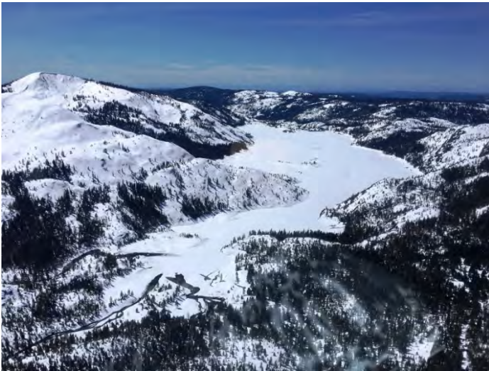
Bowman Lake (5,650 ft) recorded 64 inches of snow, 158% of average (April).

The District conducts three official snow surveys each year in February, March and April. On average, the 5,650-foot elevation reservoir receives 69.2 inches of snow and rain each year. As a member of the California Cooperative Snow Survey , NID provides snow survey results to the state to determine water availability locally and statewide.