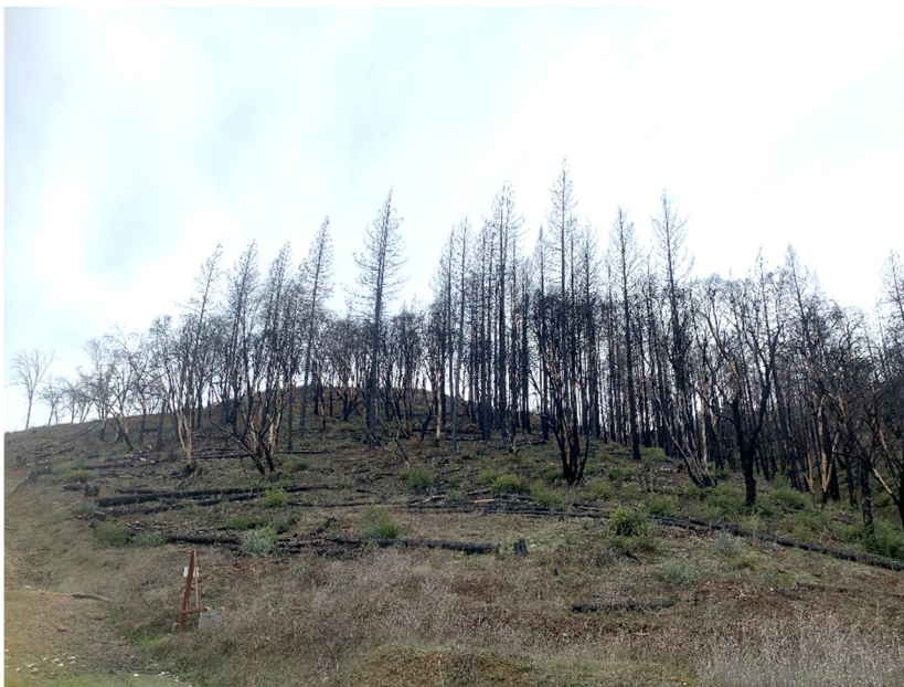
Unit 2 Area: large, burned trees will be cut, chipped and spread during this project