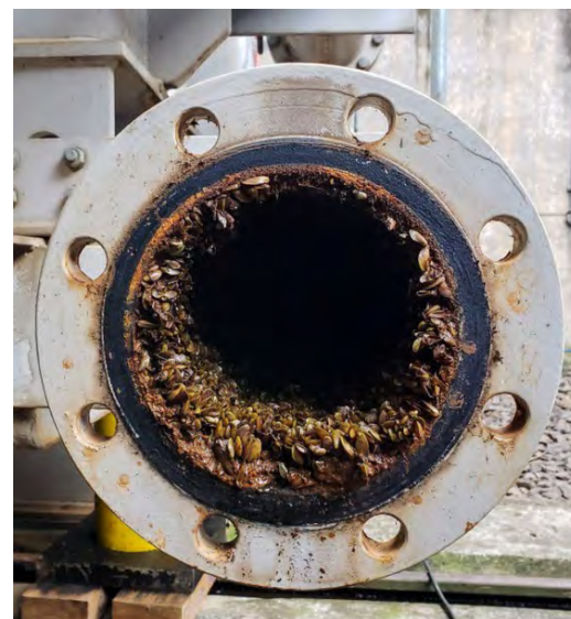
Golden mussels colonize a water pipe at a hydroelectric plant in Brazil in 2021.

Other districts and cities are taking action, as well. For example, East Bay Municipal Utility District has temporarily closed boat launches on its Lake Camanche, and the City of Napa has closed the launch and banned boats on Lake Hennessey. Also, the Bureau of Reclamation and Solano County Water District have implemented a 30-day quarantine for all boats entering Lake Berryessa.