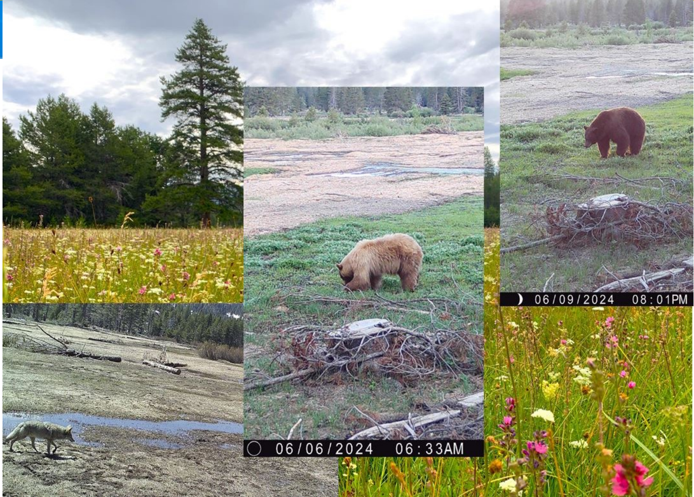
A camera captures wildlife at the English Meadow restoration site. See photos on Page 4