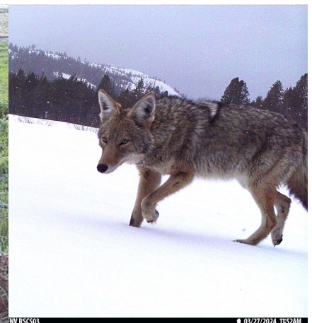
Snow was deep when a coyote strolled by on March 27.

Recently, two black bears were captured on camera.