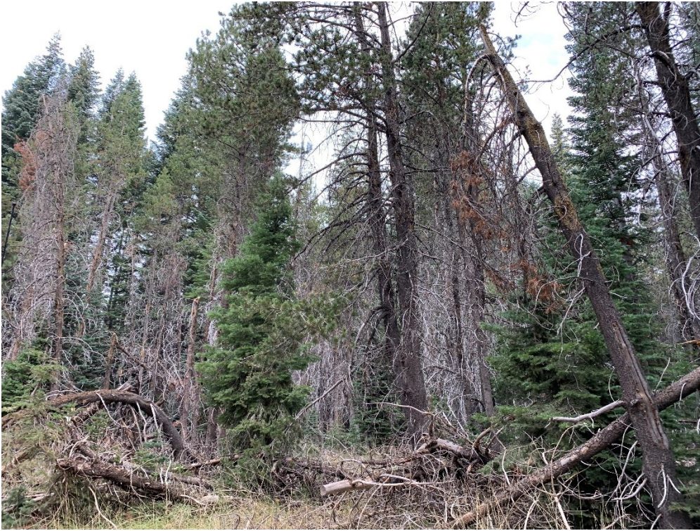
Austin Meadows - mastication treatment unit