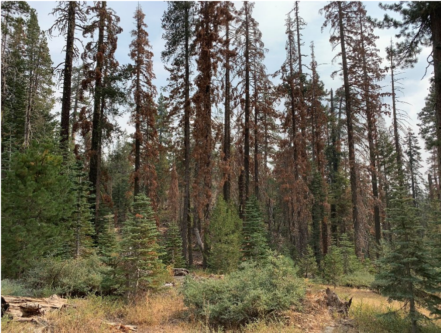
Woodcamp Campground (Jackson Meadows)– mastication unit