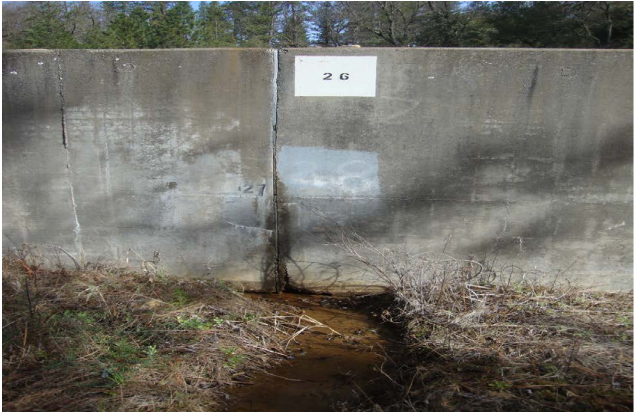
TYPICAL JOINT LEAKAGE. NOTICE BOTTOM OF CONCRETE FLUME IS EXPOSED AROUND THE JOINT AND HAS BEGUN DETERIORATING ALONG BOTTOM.