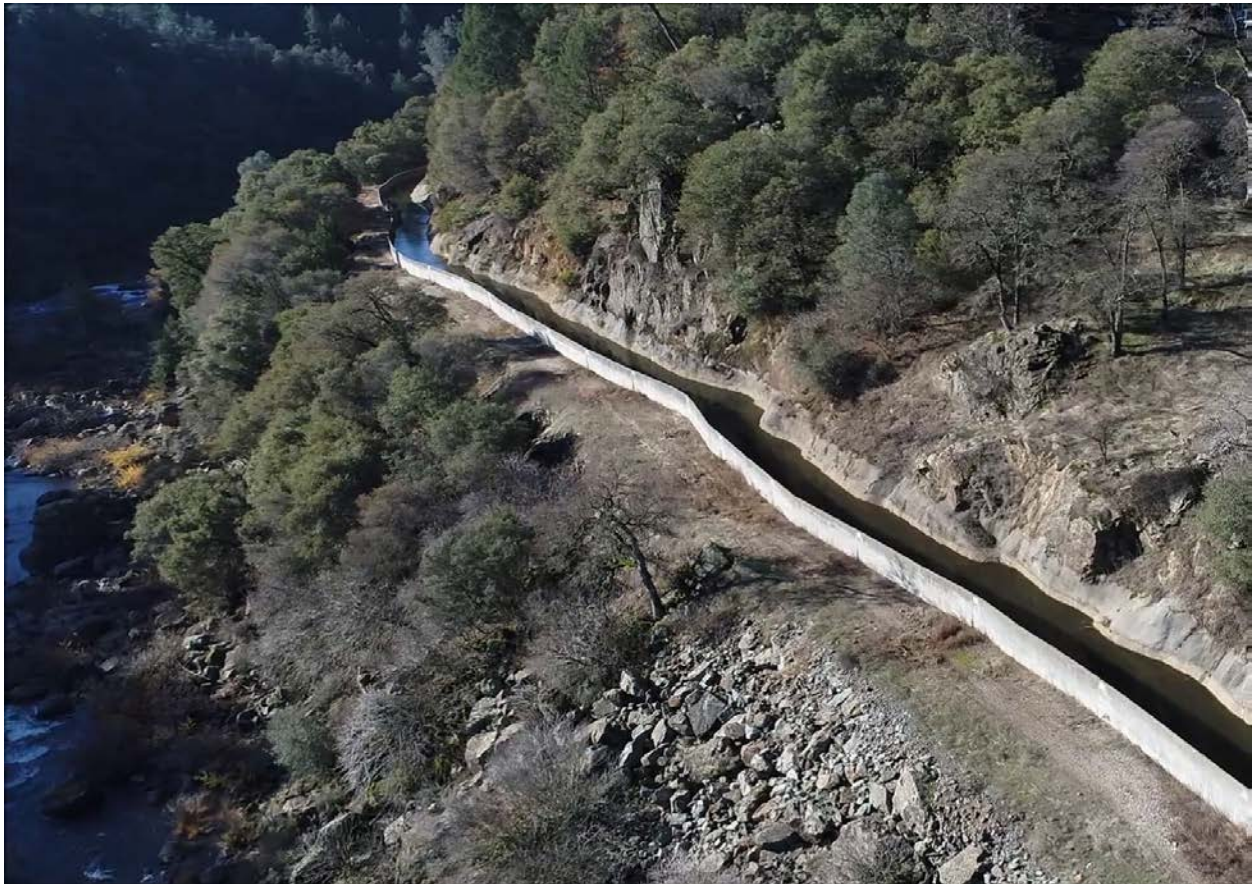
TYPICAL SECTION OF CANAL