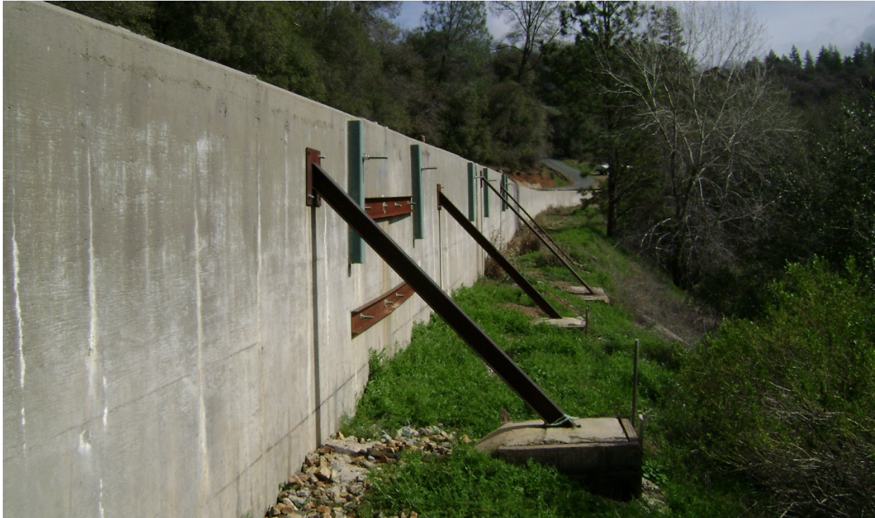
BRACING AND CABLE TIE BACKS ALONG FILL SECTION WITH WALL ROTATION.