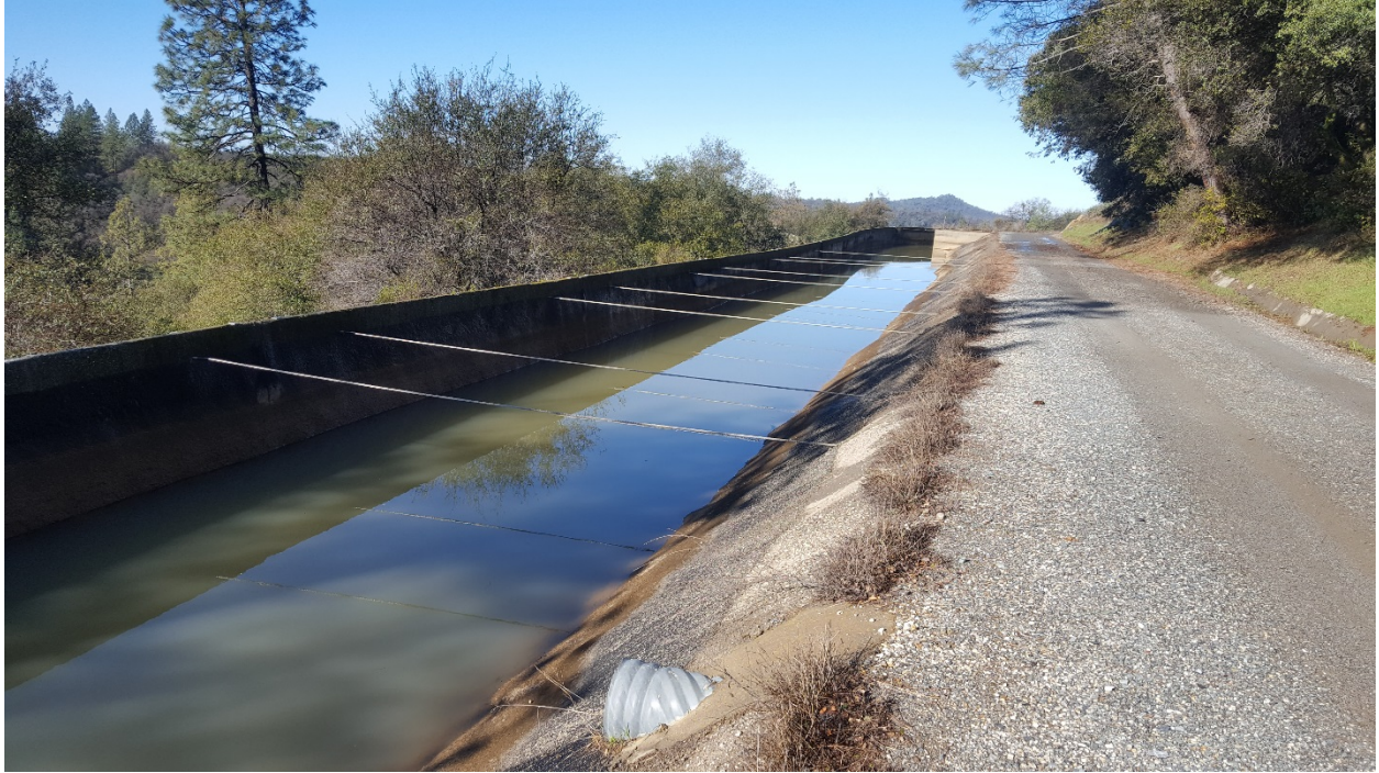
CABLE TIE BACKS ALONG FILL SECTION WITH WALL ROTATION