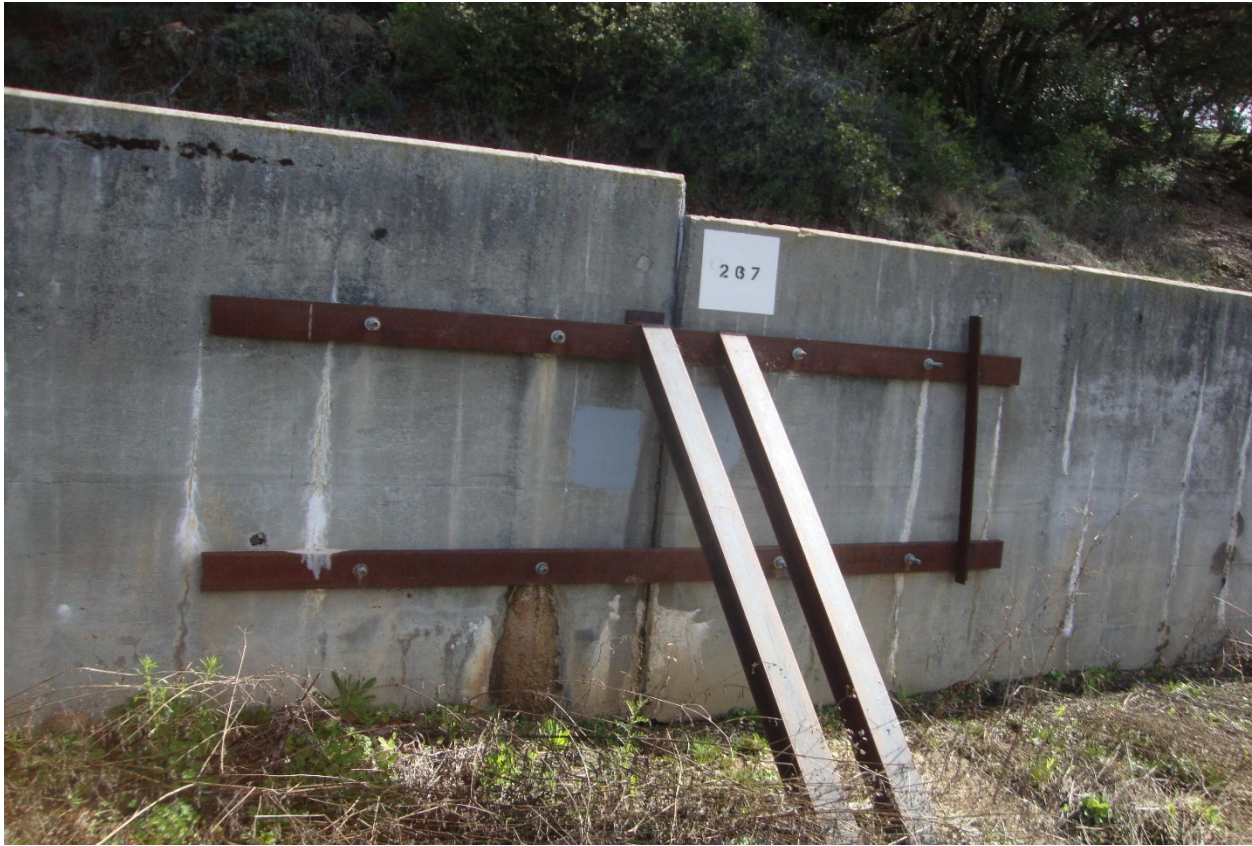
BRACING AT JOINT WITH WALL SEPARATION AND ROTATION.