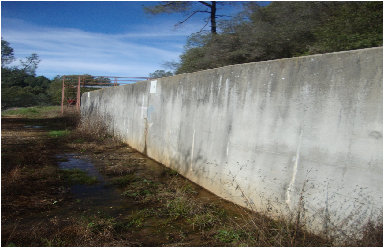
LEAKAGE ALONG WALL.